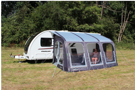
E-Sport Air 400

Outer front Height: 180CM Adjustable Height: 235-250CM